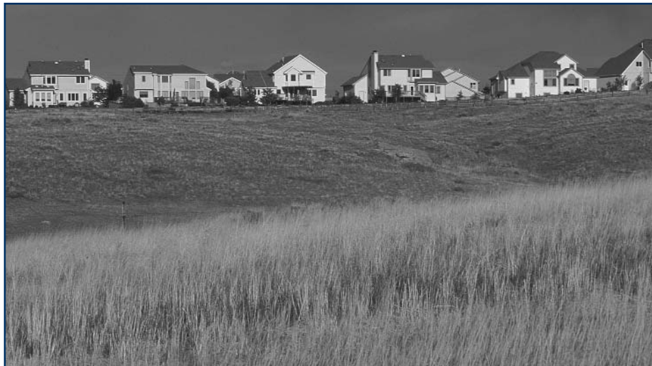
Urban sprawl is typically defined as urban and metropolitan regions spilling over into the surrounding countryside.

Some examples of a more coordinated planning effort across regional and county boundaries include greenbelts (green, undeveloped areas between population settlements), tax incentives and infrastructure provisions. With this type of cooperation, urban centers can promote new growth among their current housing stock to better utilize existing infrastructure, while a rural community can create incentives for those who wish to relocate. Cooperation can allow communities to share the costs and benefits of growth. Urban communities can share employment-based tax receipts with rural