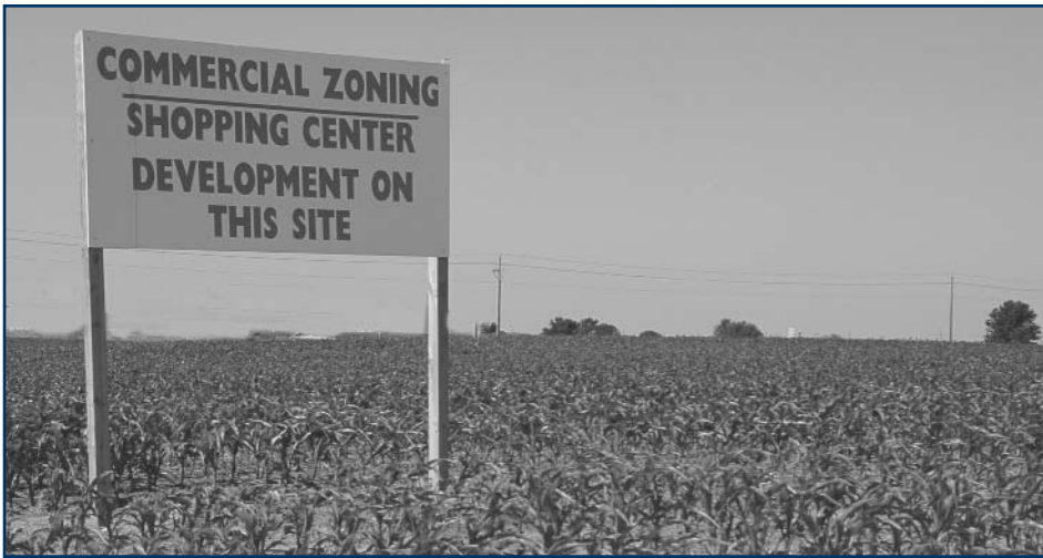
People cringe at the sound of two simple words: planning and zoning.